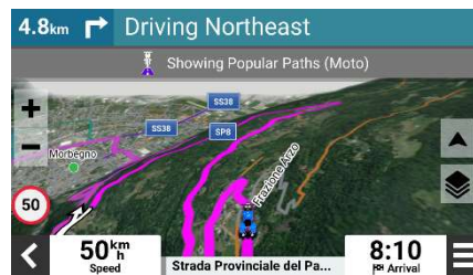
POPULAR PATHS (MOTO)