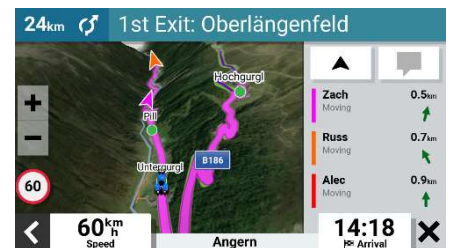
GROUP RIDE MOBILE