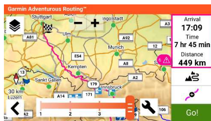
GARMIN ADVENTUROUS ROUTING™